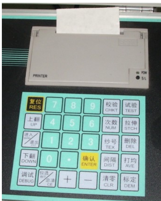
Printer & control panel