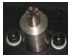
Special designed holder